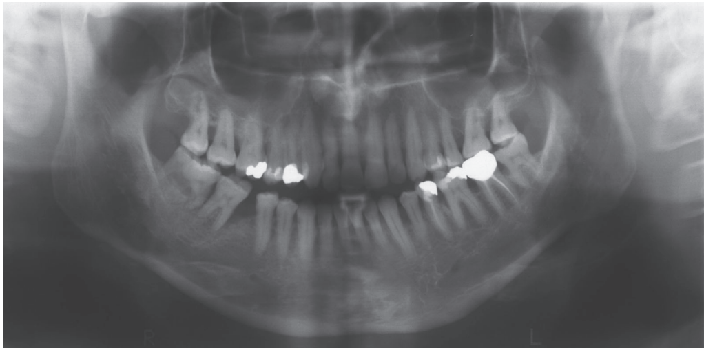
Fig. 6 Panoramic radiograph taken 20 years prior to tooth removal shows the geminated tooth of 48. Tooth 46 was already missing at that time. Third molar 38 can be described as normal in size and shape.

retention of these dental anomalies. These problems include especially caries and crowding. In our presented case, tooth 46 was removed from the patient at the age of 20 due to pain. At that time, the technology of CBCT was not yet available for a radiographic examination of this tooth anomaly in region 48. Of course, conventional CT could have been used for clarification. The result of this special case constellation was that the geminated tooth was able to erupt and also fit into the tooth row without orthodontic therapy. According to the patient history, this tooth had been in function for almost 50 years. When the double tooth erupted ultimately remains unclear. It must be assumed that this took place a few years after the removal of tooth 46 and mesialization of tooth 47. The double tooth shows the characteristic features of gemination clinically and radiographically. The tooth crown is enlarged, resembles two teeth, and has a retraction as separation of the enlarged tooth crown. The rootstock consists of several roots with a contiguous pulp. Another special