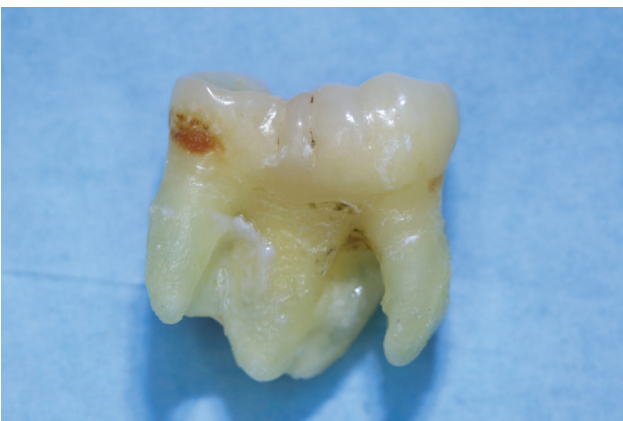
Fig. 4 Buccal view of the geminated tooth of 48.

When specifically addressed, the patient recalls that the lower right first molar had to be removed at around the age of 20 due to recurrent pain. However, the exact dental diagnosis remains unknown. Whether gemination was already present at that time is not remembered by the patient. The patient had no orthodontic treatment. During routine dental check-ups, however, he had been repeatedly asked about his particular tooth over the past decades. For him, it had always been just a normal tooth. After appropriate research, a conventional panoramic radiograph taken 20 years before