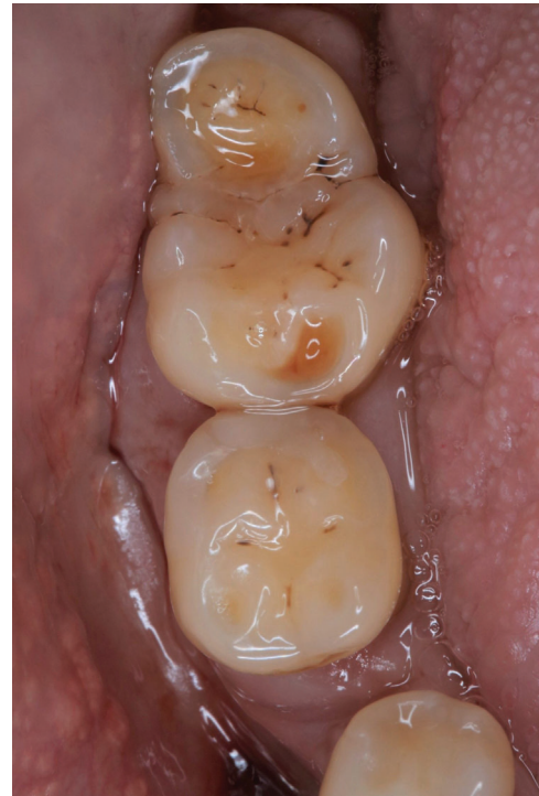
Fig. 1 Clinical image of the tooth structure in region 48. The tooth 46 is missing. The suspected diagnosis of geminated tooth of 48 was made.

The patient reported that the tooth structure had always been present and that it had not caused any problems so far. Clinical inspection further revealed that the pocket probing