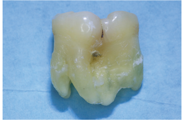
Fig. 5 Lingual view of the geminated tooth of 48. The large crown is partially separated.

the tooth removal could be organized. Even then, the radiography shows the missing mandibular tooth 46 and the geminated tooth of 48. On the opposite side, third molar 38 is normal (►Fig. 6).