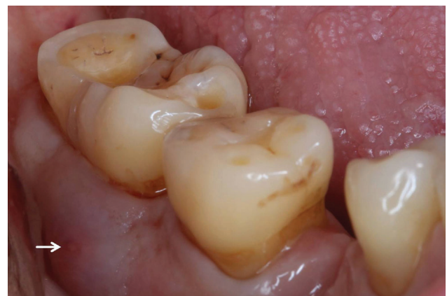
Fig. 2 Anterior view: swelling and fistula (white arrow) in the buccal mucosa.

The sensitivity test performed with CO 2 snow was positive. According to the Miller classification, the tooth had a grade 1 degree of looseness. By applying gentle pressure to the area of intraoral swelling, exudate could be expressed through the fistula opening. A panoramic radiograph was then taken (→ Fig. 3). On the radiograph, the large radiopaque mass was found in the mandibular right third molar region. The radiological appearance was highly suggestive of gemination of the third molar during development and therefore a geminated tooth of 48 was diagnosed. Due to advanced vertical bone resorption and increased pocket probing